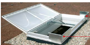
JET-SHEV light dome with wind baffles for an optimized aerodynamic degree of efficiency