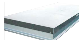
JET-aluminium dark flap opened in final position after the SHEV activation and in closed position