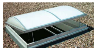
JET-VARIO light flap with SHEV device and electrical motors in ventilation position